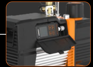
Vacuum Gauge Compartment