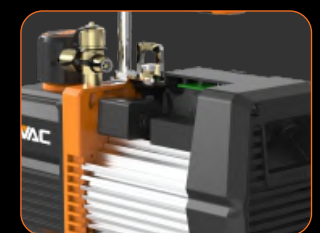
Automatic Control Valve