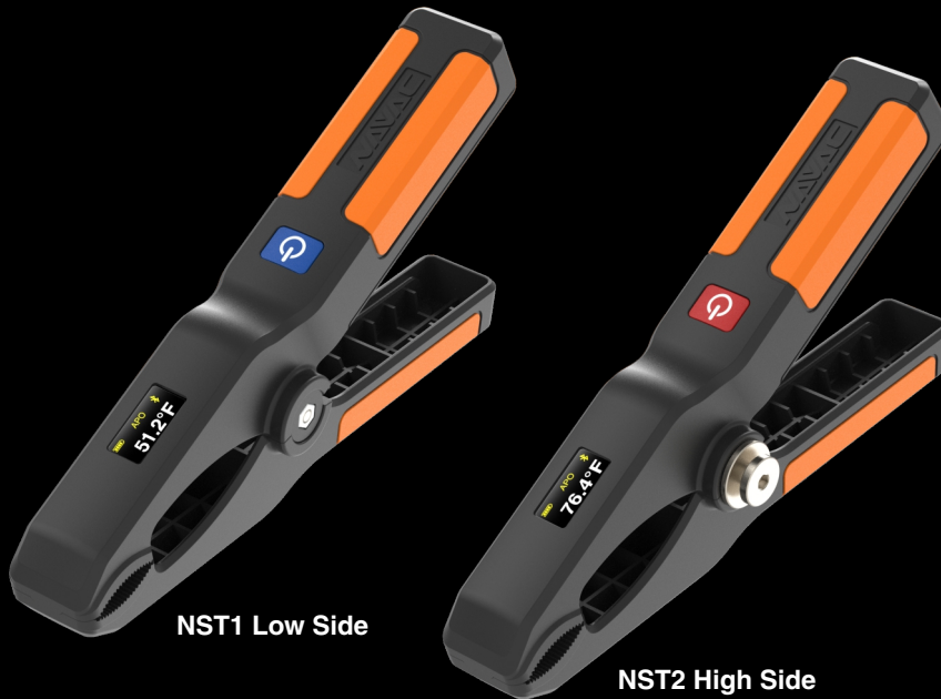
NST1 Low Side