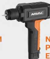
NTE11L POWER EXPANDER