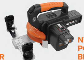
NTB7L POWER BENDER