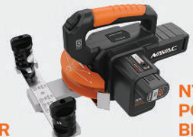
NTB7L POWER BENDER