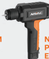
NTE11L POWER EXPANDER