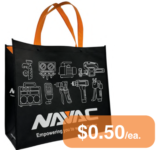
Item# MM030 Tote Bag Non-Woven Tote Bag, 17"W x 14"L x 5"D

Co-op funded will be applied to purchase total. Amounts in excess of available co-op will be billed to purchaser's NAVAC account.