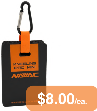
Item# MM029 Mini Kneeling Pad NAVAC Mini Kneeling Pad, 4"x6", 1" thickness, with carabiner.